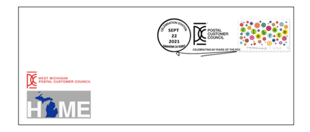
*Refer to Publication 186 for a detailed guide for Pictorial Postmarks